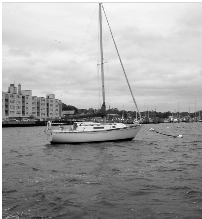
Billierina experiences her final moments in the mooring field prior to being taken up river for Winter hauling in late October, 2004.