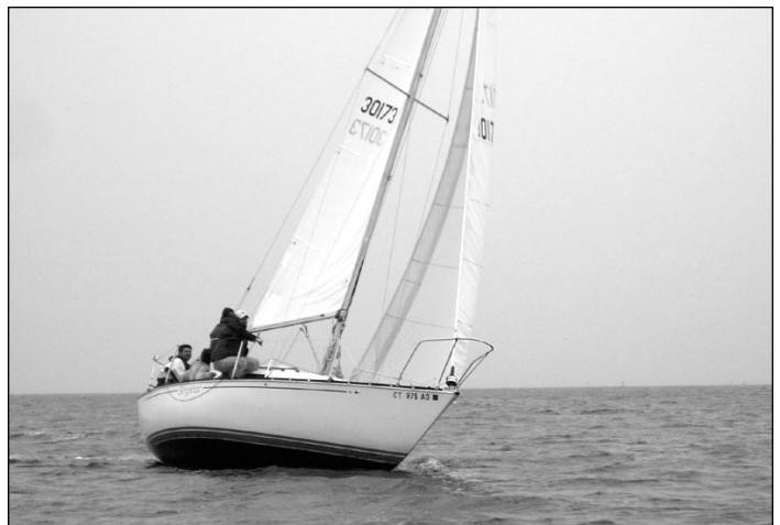
Rui Varandas skippers Slingshot , his C&C through the heavy air during the latter end of the TYC Chowder Series