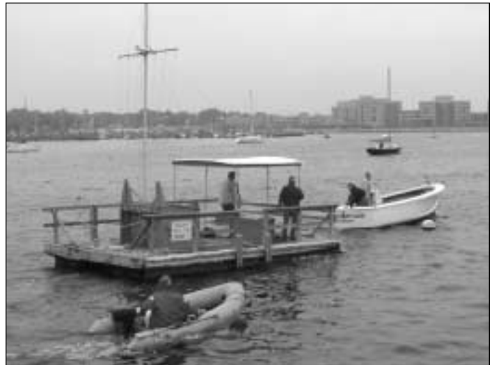
Queen Merry is towed out to her mooring. A clear indication that the 2004 racing season has arrived.