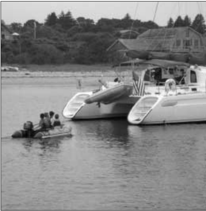
The Huff and Fox children make it out to Foxrose during the 2003 season on a cruise to Martha's Vineyard.