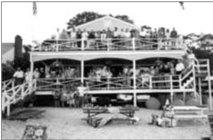
Membership Weekend '03 participants gather for a group photo at the clubhouse.