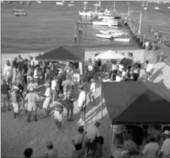
Participants of the 2003 Commodore's Trophy Race enjoy the after race festivities hosted by The Thames Yacht Club.

Remember the Commodore's Trophy Race in September, well thanks to everyone again who helped, we were named the ECSA OUTSTANDING PARTY/THE RICHARD H. ROBERTS TROPHY for year 2003. And I quote "The Thames Yacht Club pulled off an outstanding party. They always welcome racers to their beautiful club and make them feel at home. They greet and wish us well. The food that was served was delicious. When the oysters were going to be late, they announced it to us. Wow what a refreshing way to handle things, just telling the truth." What a wonderful compliment coming from the ECSA sailors who voted. Thank you again and again!