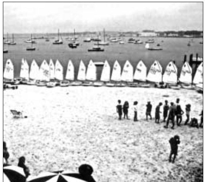
Optimists line the beach at Thames Yacht Club as the young sailors gather prior to launching.