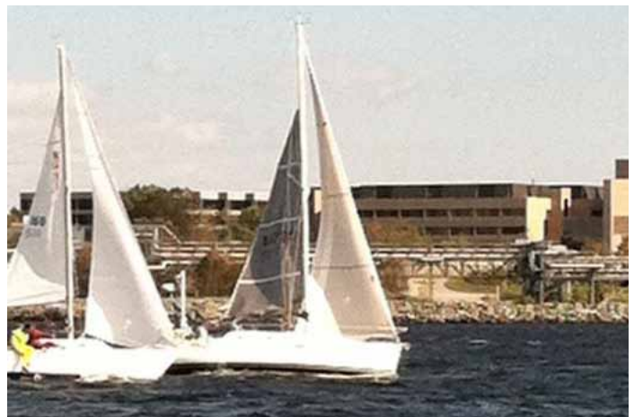
Chowder Series Race with big wind.