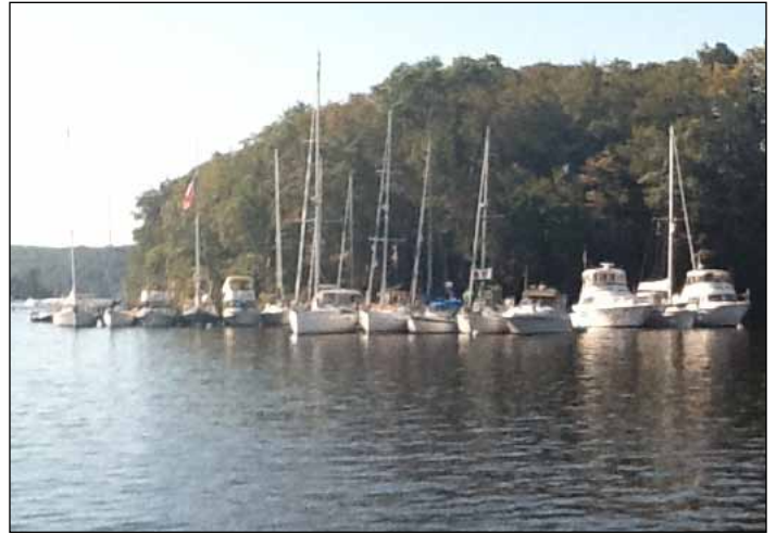
Beginnings of Fishing Boat Party