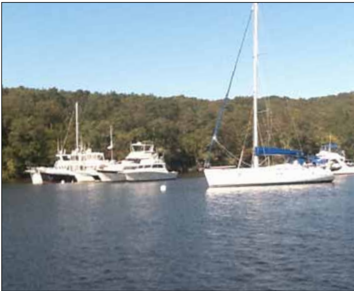
Another Raft Party.

Columbus Day weekend is the traditional end of season cruise for TYC. In the past many TYC members have joined the cruise and rafted in Hamburg Cove to enjoy the foliage, the dinghy excursions etc. Rafts of 10 and 15 boats were common occurrences which precipitated great cocktail parties and overall good times.