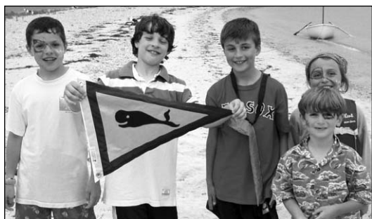
Presentation of the Golden Whale Burgee at the Hammock Rock Pirate's Cookout Cruise on June 17th