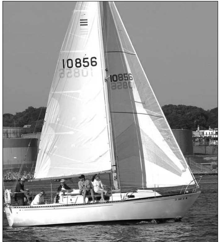
Billierina , the Mainsheet Editor's C&C 27 with his guest "Minnesota Crew" keeping an eye on the competition prior to the start of the B Class Race.