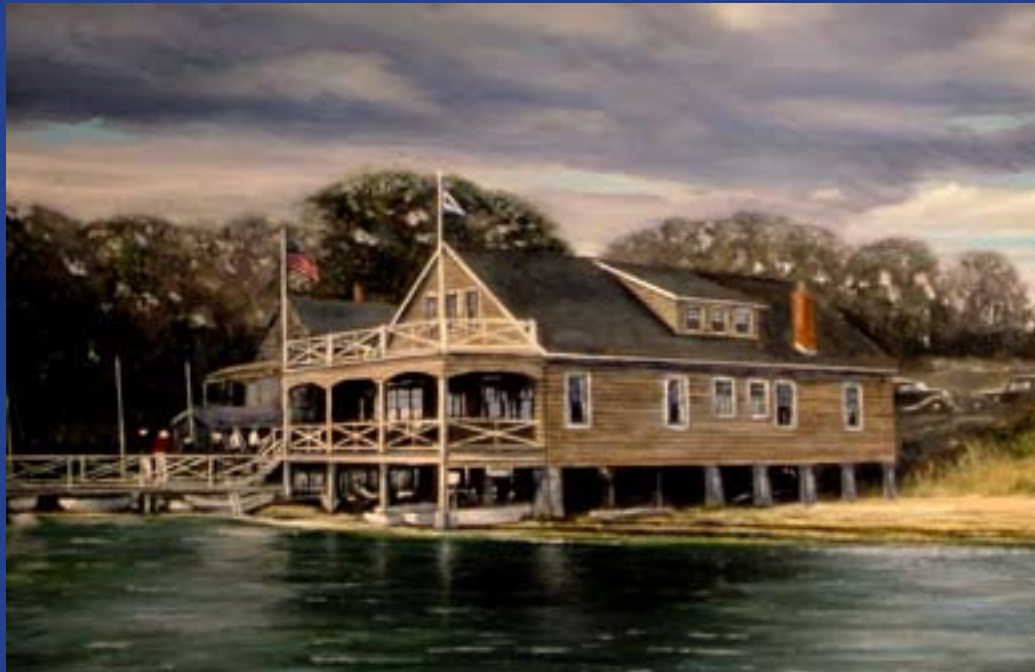
TYC Circa 1940